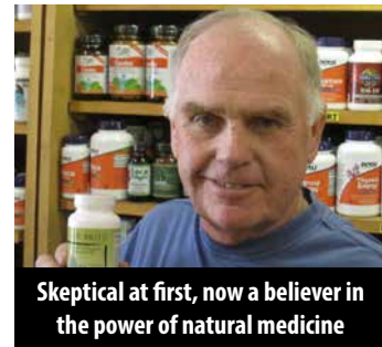
Skeptical at first, now a believer in the power of natural medicine