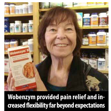
Wobenzym provided pain relief and increased flexibility far beyond expectations