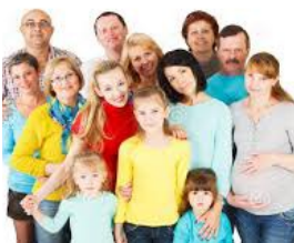
Shopping local benefits everyone!