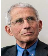
"Pandemic of the unvaccinated" appears to be unsubstantiated

When it came to Covid and the hugely profitable vaccines for it, that was the $100 billion dollar question. During the final weeks of 2021 when Covid deaths across the country skyrocketed we heard all the alarming soundbites: CDC director, Dr. Rochelle Wallensky, President Biden, Dr. Anthony Fauci, Surgeon General Vivek Murthy, Dr. Peter Hotez, deliver virtually identical messaging: "Pandemic of the unvaccinated, 99% of Covid deaths are among the unvaccinated."