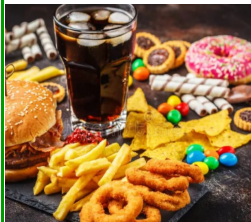
23% of Food Stamp dollars are spent on junk foods

The physiological mechanism causing the increase in obesity is no mystery: Americans eat more calories than they burn and the excess energy is stored as fat. The intellectual and societal mechanisms contributing to obesity and diabetes are not as immediately obvious.