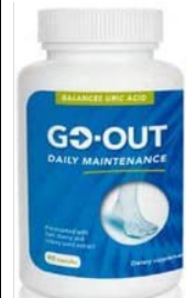
2 formulas, daily maintenance or extra strength

Gout is characterized by excruciating, sudden burning pain as well as swelling, redness and stiffness in the affected joint. It occurs most commonly in the big toe but can happen anywhere. Uric acid crystals inside the joint cause intense pain whenever it's flexed.