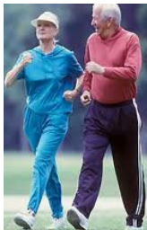
Co-Q-10 can make exercise easier

There have been at least 8 international conferences on the clinical aspects of Co-Q-10. 3,000 papers submitted by 200 different physicians and scientists from 18 countries. Most focused on heart disease and were remarkably consistent. The conclusion: Heart function is significantly improved by Co-Q-10 while producing nearly no adverse side-effects or drug interactions. Most who used it also felt more energy.