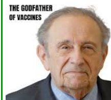
THE GODFATHER OF VACCINES

Now, after decades of Plotkin and his disciples (and as a result, virtually every med school graduate) along with the entire medical and mainstream media establishments insisting that vaccines are among the most thoroughly tested products in the world, last month Plotkin published an article in the New England Journal of Medicine