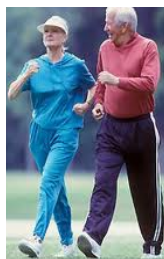
Co-Q-10 can make exercise easier

For people diagnosed with myocarditis, congestive heart failure, and other heart issues, a mountain of independent peer-reviewed research proves that Co-Q-10 is one of the first things doctors should be recommending for their cardiac patients.