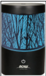
Background color slowly changes