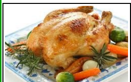
Organic Smart Chicken is incredibly healthy, juicy, & delicious

Charleyhorses On Sale ... 10% Off Thru December 21 st