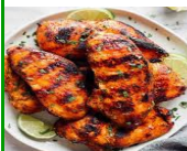
boneless, skinless, grilled breast

In preparing for each presentation I learn a lot and engaging in the Q & A session with attendees is always fun for everyone.