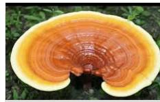
Reishi may be the "King" of immune enhancers

Reishi is often called the "King of Mushrooms." It is one of the world's most researched botanicals and has been shown consistently to benefit the mind and body. In Chinese medicine it's taken to boost immunity against everything from the common cold to cancer by increasing the activity of the body's essential white blood cells. The Reishi mushroom is also famous for its soothing, relaxation and sleep-enhancing effects. It can even promote relief and mood enhancement for people dealing with anxiety or depression while alleviating fatigue. Seasonal allergy sufferers frequently find relief when supplementing with Reishi. It's often used treating hepatitis B patients and patients with chronic bronchitis showed clinical improvement using it, especially older patients with asthma. Reishi has been shown to regenerate bronchial epithelium (bronchial tract lining).