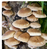
Shiitake is medicinal and also delicious

Shiitake Mushroom is a potent immune-boosting mushroom with antitumor and antiviral properties. It can also help reduce blood pressure and cholesterol. Shiitake is used medically for diseases involving depressed immune function, including cancer, AIDS, environmental allergies, candida infections, and frequent flu and colds. An injectable form of Shiitake mushrooms is often used alongside chemotherapy in China and Japan for the treatment of gastric cancer.