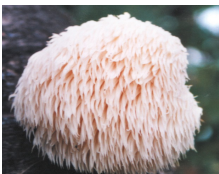
Lion's Mane is proven to improve cognitive function

Lion's Mane Mushrooms: Compounds in Lion's Mane promote the creation of nerve growth factor (NGF) which can enhance cognitive abilities by regulating and renewing cells in the nervous system. One Japanese study showed that Lion's Mane supplementation provided significant cognitive improvement in older adults who were suffering from mild cognitive impairment. It helped the brain in all aspects including aiding in memory, concentration, and even depression and anxiety. The abundance of antioxidants in them can also reduce inflammation, which is helpful for people who deal with digestive issues like irritable bowel syndrome (IBS). We've had reports from customers afflicted with MS that Lion's Mane created significant benefits to the nervous system throughout their bodies.