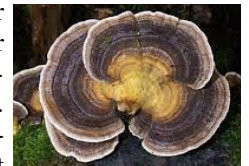
Turkey Tail is considered a cancer fighter

Turkey Tail Mushrooms: They're prized for their immune-boosting and anti-cancer potential. It's one of the most widely used anti-cancer supplements in Japan and China. Turkey Tail's powerful white blood cell-boosting qualities are believed to help treat several different kinds of cancers by suppressing tumor growth. Turkey tail can also help chemo patients, repairing immune cell damage that was caused by chemotherapy. The prebiotics present in turkey tail mushrooms also makes it a great ingredient to improve digestion and overall gut health.